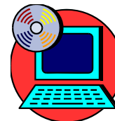
TABLE GAMES/COMPUTER ROOM

Age Group: Open Monday-Thursday~3:00-7:00 p.m.