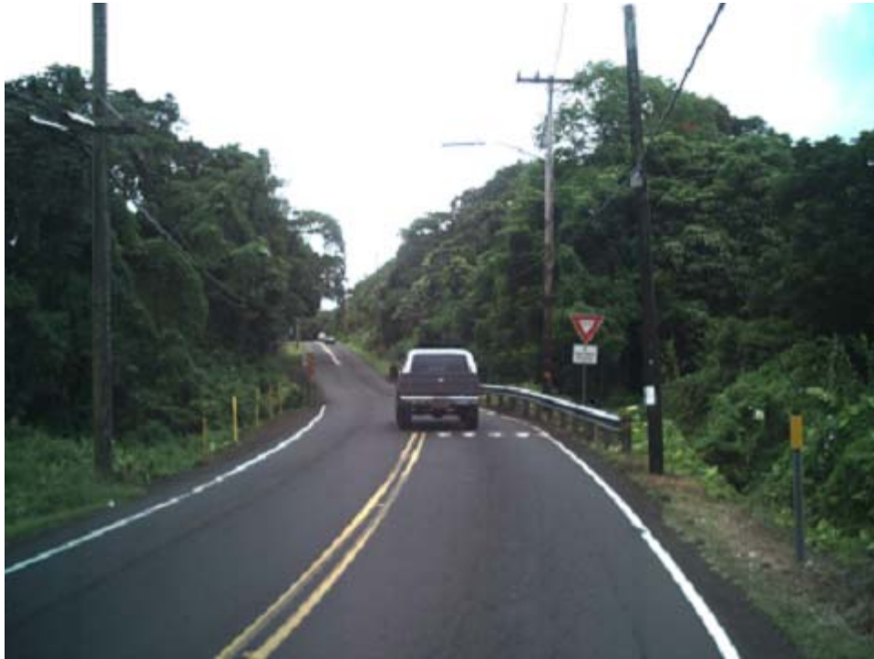
Photo caption: The “yield” and right-of-way at the 4-mile bridge on Kilauea Avenue in South Hilo will be reversed beginning next week.